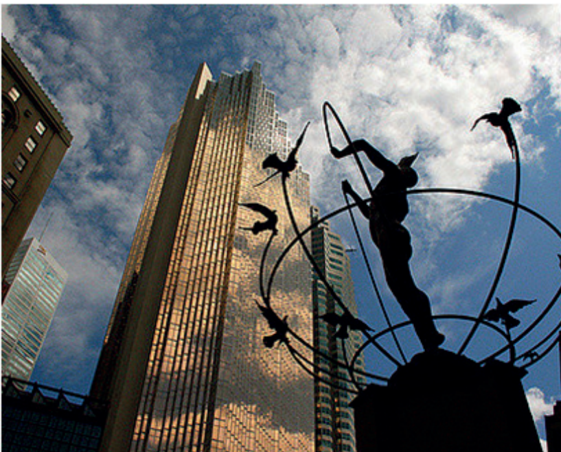
'Monument to Multiculturalism' by Francesco Perilli in Toronto

Of the two invited Thinkers, Tariq Modood (from the UK) has expertise in studying the phenomenon at a macro, ideational and symbolic level, whereas Frank Bovenkerk (from the Netherlands) has a more micro approach on an everyday, behavioural and interactional level. The UK has a lively and public debate on the theory of multiculturalism, whereas empirical social science research in the Netherlands has produced many insights into the practical side of the problem. The complementarity of their backgrounds and expertise is an asset for the programme.